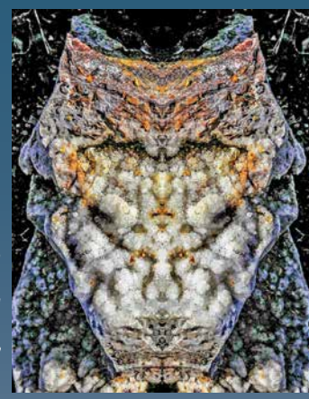
Lyndia Radice Digitally Crafted Photography