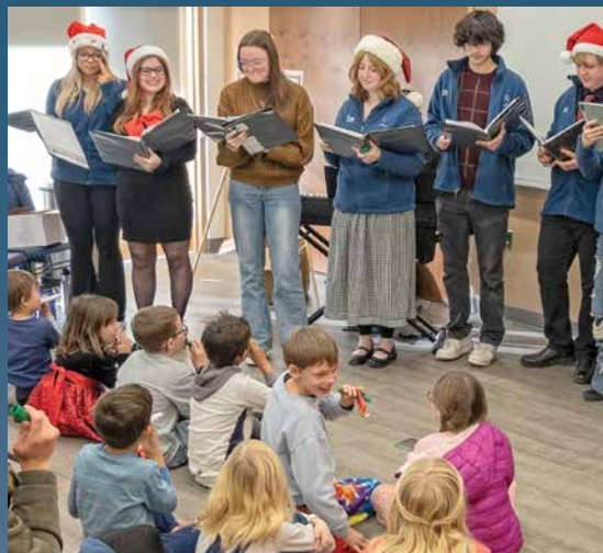
Young Voices of Santa Fe Opera